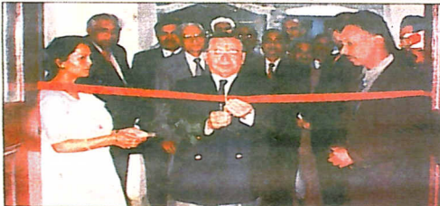
शनिवार को हाईकोर्ट परिसर में राज्य विधिक सेवा प्राधिकरण के कार्यालय का उद्घाटन करते सुप्रीम कोर्ट के मुख्य न्यायाधीश न्यायमूर्ति बीएन कृपाल।