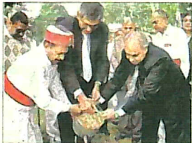
उत्तराखण्ड हाईकोर्ट के चीफ जस्टिस बारिन घोष (दरमیان) ने नया कानून लागू करने के लिए शिलान्यास किया।

सर्वोच्च न्यायाधीश के अंतर्गत एक नया कानून लागू होगा। इससे वादवादी को जल्द से जल्द ही न्याय मिलेगा।