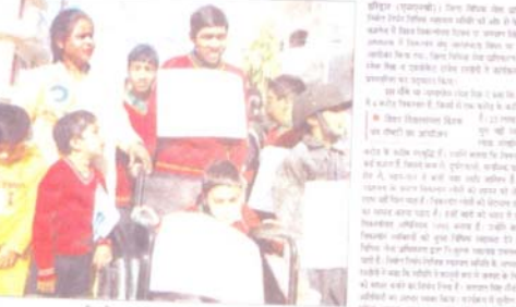
जिला विधिक सेवा प्राधिकरण के अंतर्गत जिला जज के अंतर्गत जिला जज के अंतर्गत