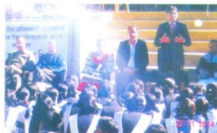
Civil Judge (J.D.), Ranikhet at GIC, Naugaon, Almora on 22.11.2014