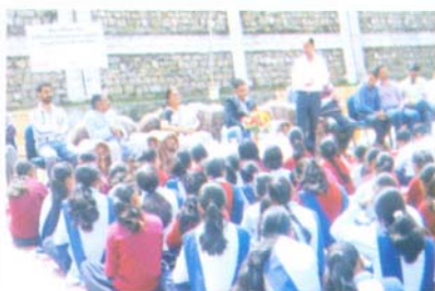
On 4.10.2014 Students attending the micro legal literacy programme at District-Chamoli