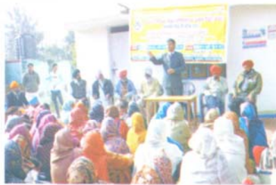
Secretary, DLSA Udham Singh Nagar sensitizing the people on 18.12.2014