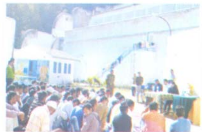
Jail camp at District Jail, Tehri Garhwal on 6.11.2014