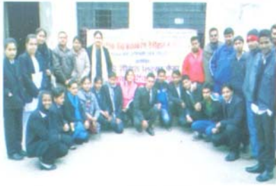
Law students participating in the Legal Literacy Camp at Ramnagar