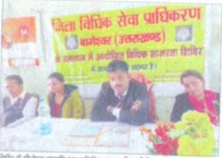
जिला विधिक सेवा प्राधिकरण (जिला जज के अंतर्गत) द्वारा आयोजित जिला जज के अंतर्गत जिला जज के अंतर्गत

शिविर : जिला जज के अंतर्गत जिला जज के अंतर्गत जिला जज के अंतर्गत