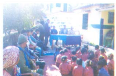
Awareness programme on 3.12.2014 at District-Chamoli on the occasion of World Handicapped Day