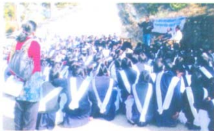
Legal Awareness Camp on Women Rights at District-Uttarkashi