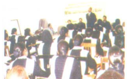
Judicial Officer Sensitizing the Students at ANM Training Centre Almora on PC-PNDT issues