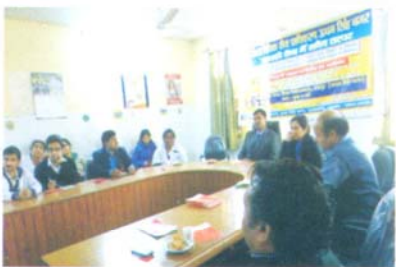
Seminar on PC&PNDT issues on 4.12.2014 at District Hospital, U.S. Nagar