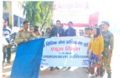
Secretary, DLSA, Haridwar during sensitization camp on 1.12.2014