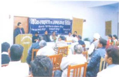
Secretary, DLSA, Haridwar sensitization the people on World Disability Day