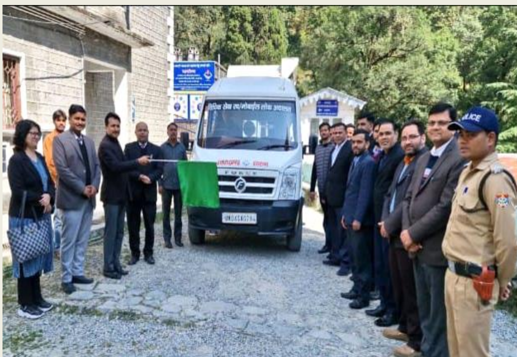
Member-Secretary, Uttarakhand SLSA, Nainital flagging off the Mobile Van for the Legal Awareness Programmes/Camps.