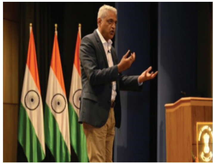
Vignette from the talk at DHCLSC

On 29th April, 2024, DLSA Leh organized a Legal Awareness Programme on "Pre-institution Mediation and Settlement" at the District Court Complex, Leh. The Panel Lawyers were trained about the legal intricacies of Pre- institution Mediation and the cross- sectional benefits arising out of the same. Towards the end of the programme, the Mediators who had undergone the 40-hour completed their Mediation Training were also awarded Certificates.