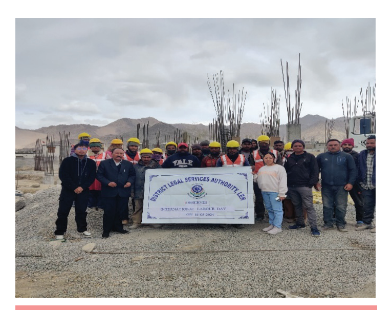
Vignette from the Legal Awareness Programme at Leh

Wisdom is giving children their wings, along with the rudder of awareness to keep them safe from the prying hands. Keeping this in mind, DLSA Jaipur, in order to spread awareness about child sexual abuse and the laws protecting children from sexual abuse, organized a Awareness Programme for the students of Eklavya Gyanpeeth School, Rakri, Jaipur on 09th May, 2024. The programme was organized in collaboration with a NGO, 'Aasra Foundation' and was attended by around 350 students.