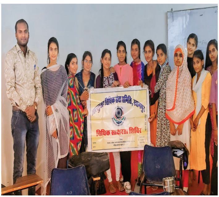
Vignette from the Legal Awareness Programme at Jaipur

On 1st May, 2024, Leh DLSA observed the International Labour Day at Melongthang. A Special Legal Awareness Programme was organized for the construction workers who were toiling hard to construct the new District Court Complex. These cosntruction workers were told about their rights under various laws and schemes. Special emphasis was laid on the different compensation schemes meant for them. The Workers were also encouraged to wear proper safety gear while working to avoid health hazards.