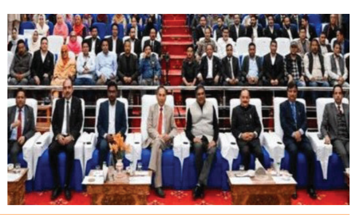
Vignettes from the visit of HMJ Sanjiv Khanna to Kargil (above) Vignettes from the Conference of DLSAs at Srinagar (below)