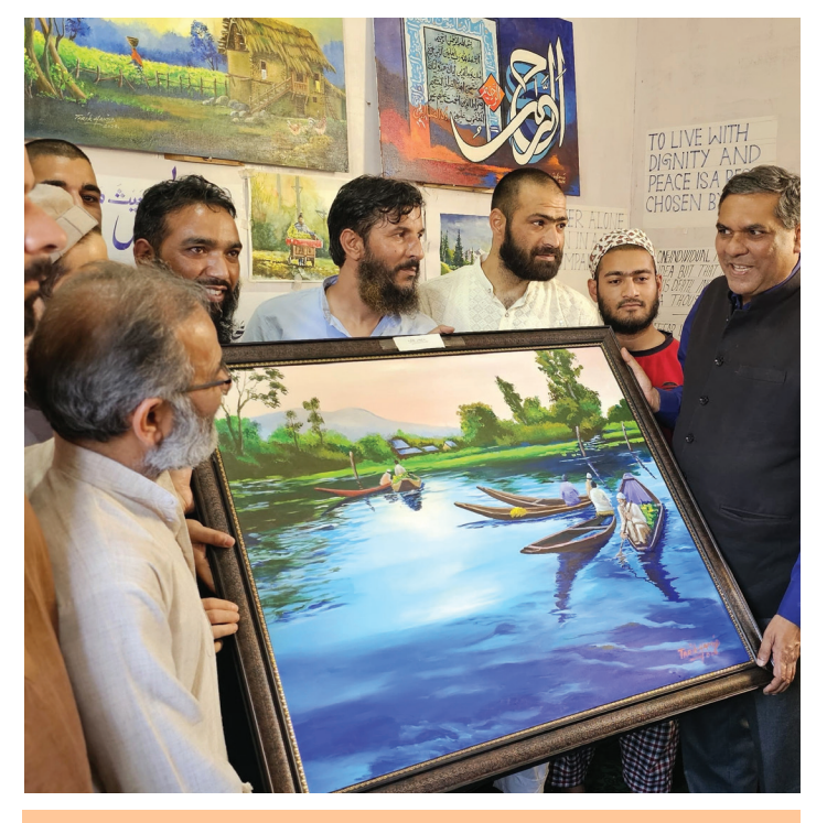
Calligraphy and Painting centre in Jail

Every individual deserves a second chance. However, in the confines of a jail, the prisoners often find themselves condemned to a life of doom and gloom. Very often they lose sight of the future. With a view to humanize the justice system and rekindle hopes in the hearts of the prisoners, DLSA, Srinagar in collaboration with the Jail Authorities at Central Jail, Srinagar has been coming up with different initiatives and programmes. By imparting one skill at a time through courses on calligraphy, painting, cooking, baking etc., these Authorities have been striving to unlock the potential of the prisoners, thereby transforming their lives.