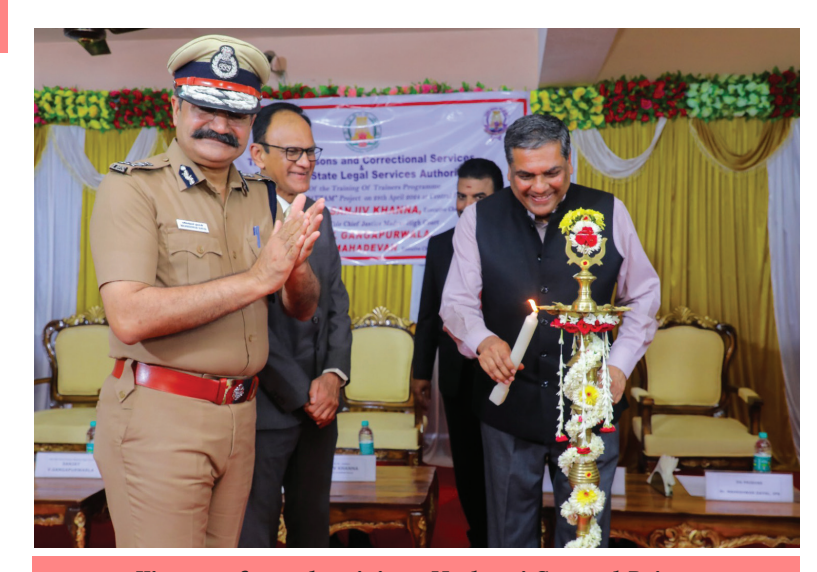
Vignette from the visit to Madurai Central Prison

On 27th April, 2024, Hon' ble Mr. Justice Sanjiv Khanna also addressed the Chairpersons and Secretaries of DLSAs of Tamil Nadu and Puducherry during the Conference of DLSAs of Tamil Nadu and Puducherry at the ADR Building, Madras High Court. This Conference had been convened to serve as a forum to discuss the challenges being faced by the DLSAs, the best/ novel practises being adopted by the Legal Services Institutions in Tamil Nadu and Puducherry, and the way forward. The Conference also facilitated the exchange of ideas and strategies among the participants, aiming to strengthen the effectiveness of legal aid services and improve the outreach of legal awareness programs in the region.