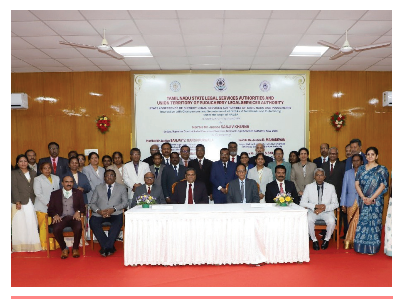
Vignette from the Conference of DLSAs of Tamil Nadu and Puducherry

On 27th April, 2024, Hon' ble Mr. Justice Sanjiv Khanna delivered the Inaugural Address during the Inaugural Session of the Special Training on Mediation Act, 2023 at the Auditorium of the Madras High Court. Terming the Conference a significant milestone in promoting peaceful resolutions, fostering positive dialogue, and creating a harmonious future, he emphasized on the importance of mediation as a powerful tool in resolving conflicts in our rapidly evolving world. He stated that the Mediation Act, 2023, would provide an incredible opportunity for all stakeholders to explore the intricacies of Mediation and unlock its vast potential.