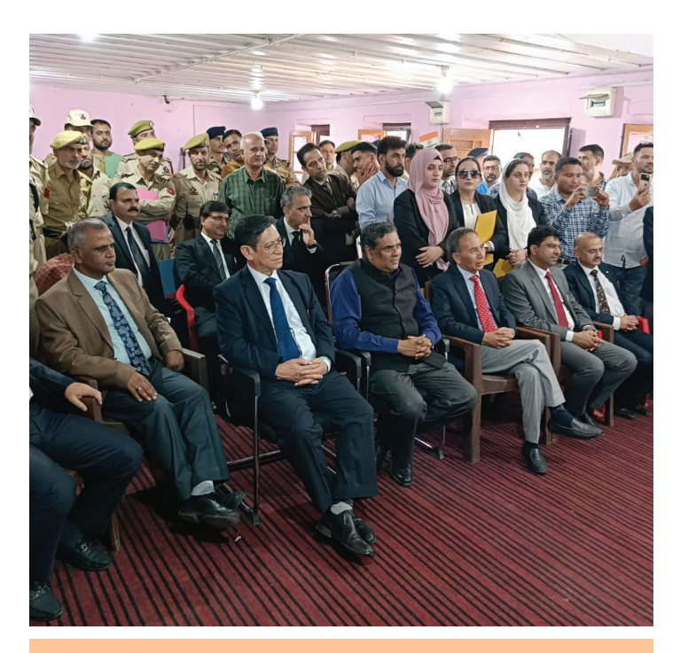
Multipurpose/Recreational activity Hall