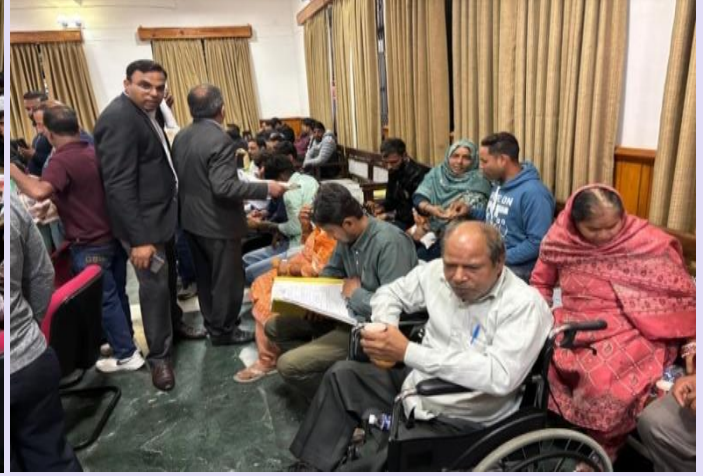
National Lok Adalat was organized on 14.09.2024 at the District Courts and Outlying Courts