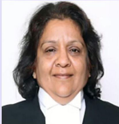
Hon'ble Ms. Justice Ritu Bahri Hon'ble Patron-in-Chief, UKLSA, Nainital